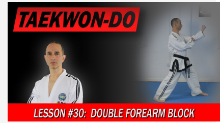
Fig 4: Double Forearm Block (Doo Palmok Makgi) — both forearms blocking simultaneously.

The double forearm block (Doo Palmok Makgi) was practiced in a walking stance as part of the later pattern sequence. Both forearms are used simultaneously to form a strong double block. Aurora was reminded to ensure she is in a walking stance for this technique before transitioning to an L-stance for the side punch.