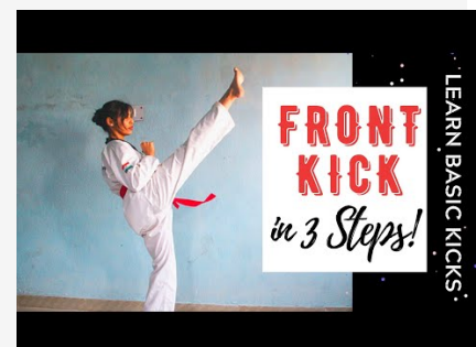
Fig 8: Front Snap Kick — ball of the foot, weight on the back leg.

Aurora practiced the front snapping kick to the knee as the second move of Joong-Gun. The ball of the foot must be used — not a football-style keepy-uppy motion. The knee comes up and the ball of the foot pushes forward and down towards the knee. The non-kicking hand must pull back to the belt as a fist , and weight must remain on the back leg throughout.